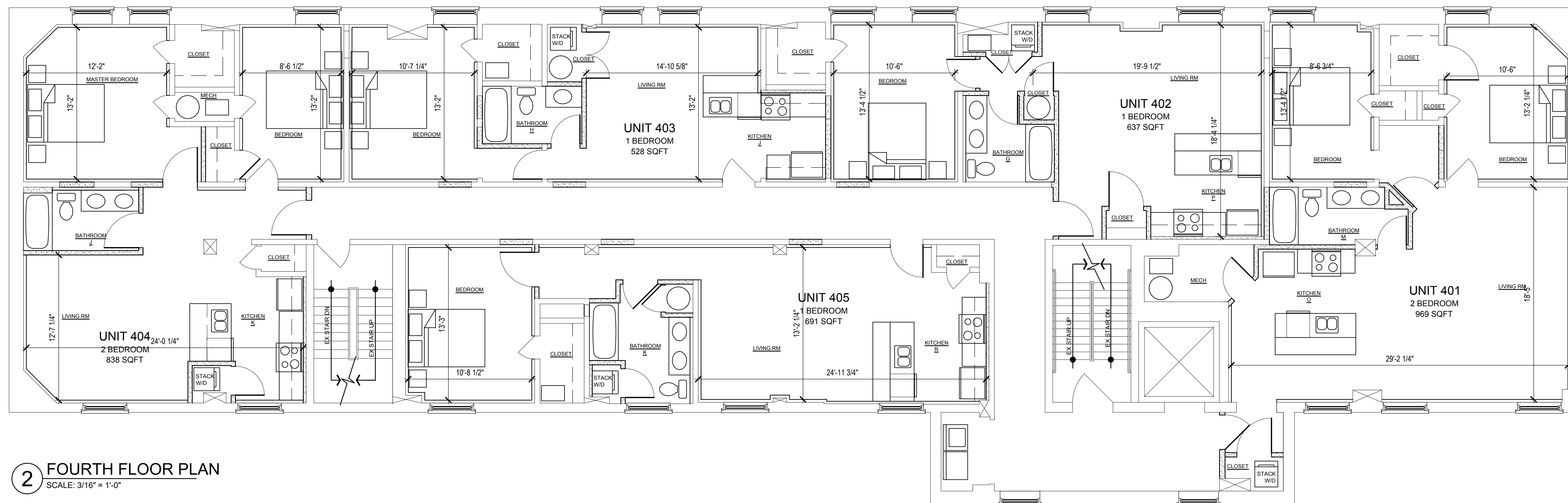
2 FOURTH FLOOR PLAN SCALE: 3/16" = 1'-0"