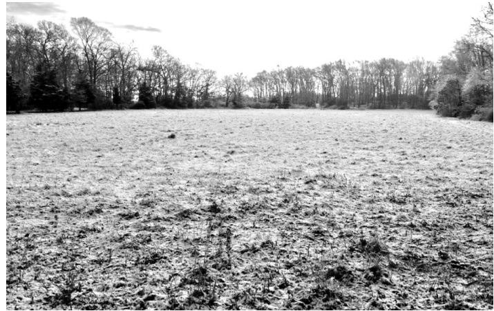
This meadow (the former Maloney property) has been preserved by the combined efforts and contributions of TNC, EH Town, neighbors and APC

In keeping with the Town's Comprehensive Plan for the hamlet of Springs, preserving this property as open space contributes to density reduction, aids in groundwater protection and provides a buffer for stormwater runoff. In addition, the Plan has identified remaining undeveloped parcels on the west side of the harbor as high priorities for public acquisition and preservation through the CPF. Preservation of this undeveloped meadow helps protect the groundwater used in our community and the already stressed surface waters of Accabonac Harbor.