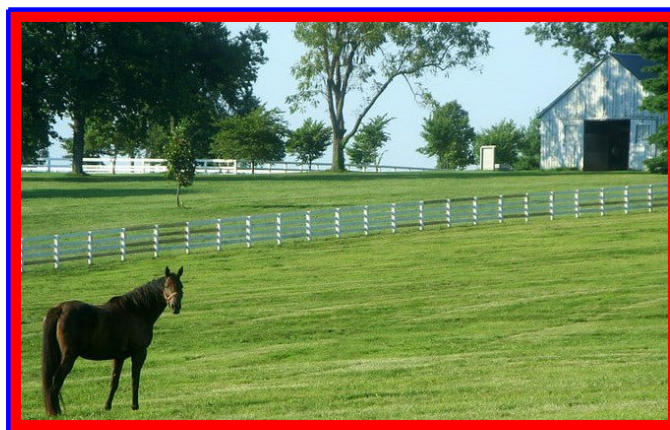
The Kentucky Horse Park

https://www.thoroughbred-center.com/tours/