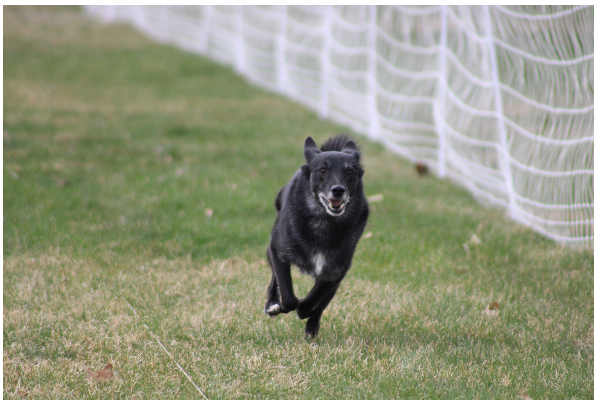
Photo: a senior Buhund running FastCAT--a change in enthusiasm for the sport might indicate pain or illness.

Julie: Any behavior that changes or gets worse suddenly, especially without another obvious cause. Obvious signs of pain or health problems include slower gait, slowness to rise or reluctance to play, reduced endurance, changes in potty habits/having accidents, snapping at or moving away from petting or grooming, and of course limping. Less glaring signs include frequent GI upset (gas, diarrhea, vomiting, lack of appetite or acid reflux), increased appetite or thirst, changes in preferred sleeping locations, less time spent interacting with people or dog-friends, repetitive behaviors including scratching, rubbing, excessive licking of self or objects, stealing, shredding, or shaking items obsessively, changes in resource guarding habits, and of course any behavior that drastically changes over a short period of time. Observe your pet closely and note what's normal and what isn't, it is much easier to remember to bring things up with your vet and/or trainer if you keep notes.