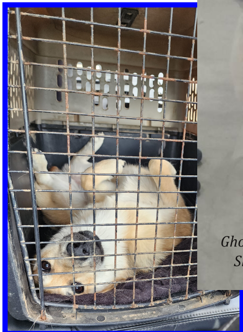
Reisling says "this travel stuff is crazy!"