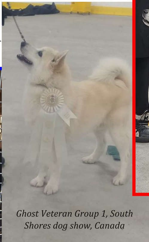
Ghost Veteran Group 1, South Shores dog show, Canada