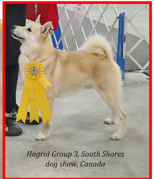
Hagrid Group 3, South Shores dog show, Canada