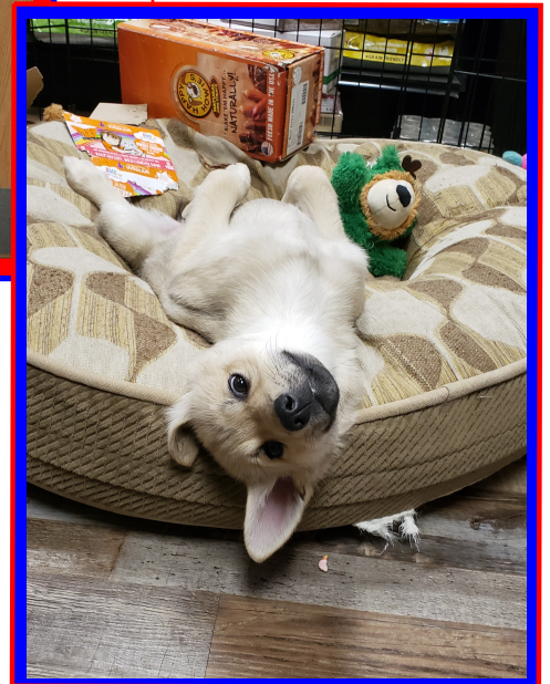
Sammi says "Goodnight!"