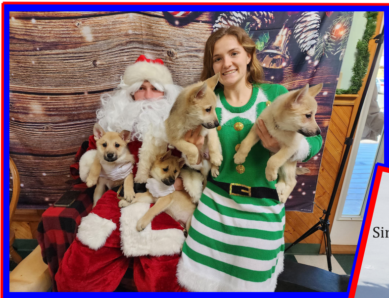
Puppies with Santa!