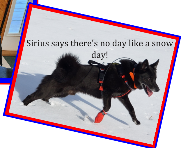
Sirius says there's no day like a snow day!