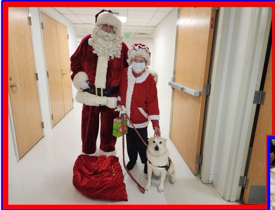
Ghost and Santa during a Therapy Visit

We love to hear from our members! Please send photos, stories, brags and ideas to buhundnews@gmail.com