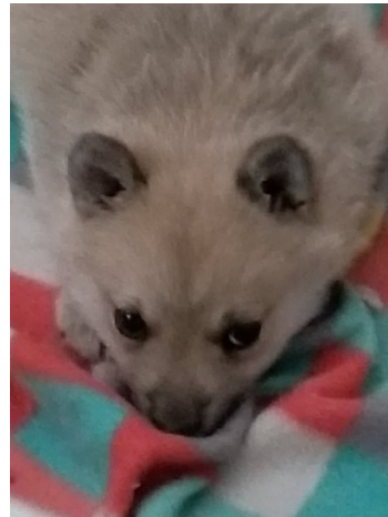
Destiny Submitted by Faye Adcox

Publication Schedule The NBCA Newsletter is published four times per year: January, April, July and October