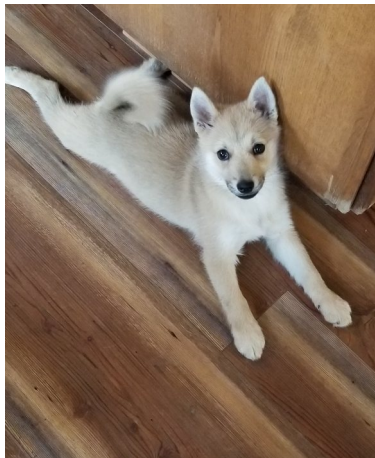
Destiny Submitted by Faye Adcox