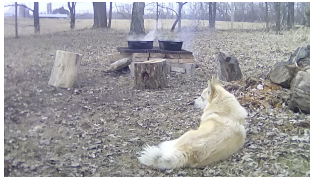
Gretchen relaxing by the maple syrup cooking fire!