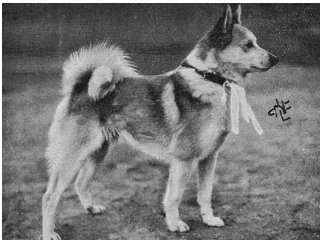
Above: Flink, the first registered Buhund in 1926

Below: I'm working with Crystal to get her behind the sheep, but further away. She was approx. 8 feet away from me and the sheep but needed to arc further out. This was one of our HT qualifying legs!