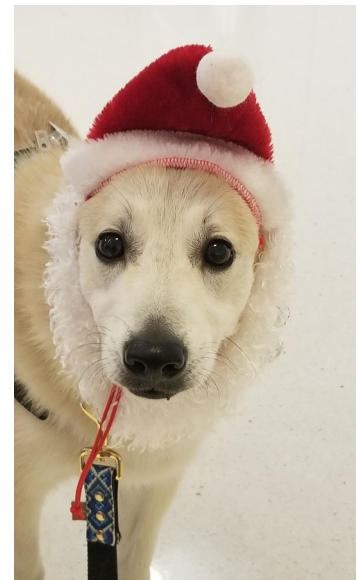
Ghost says Merry Christmas