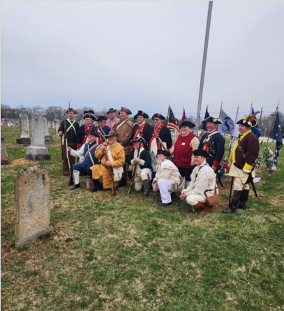
Photo above from the March 29, 2025 ceremony honoring five Revolutionary Soldiers

Comments received by August 30, 2025, will be formally documented.