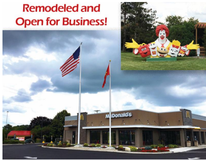
Remodeled and Open for Business!