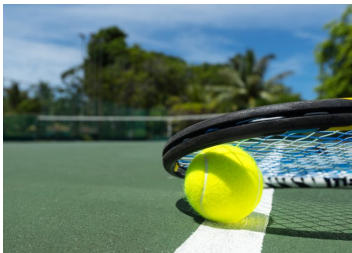
Two Pickleball, One tennis and a basketball court coming soon