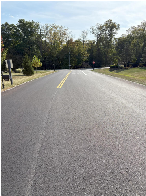
Hatherton Place looking good after being resurfaced and relined.

The township hall (above right) recently received a new look as old landscaping that had contracted disease and become overgrown was replaced and rocks in the flower beds that caused significant weeding issues were removed and beds mulched. The team also added a final touch to the hall sign (above left). The new look is clean, attractive and low maintenance.