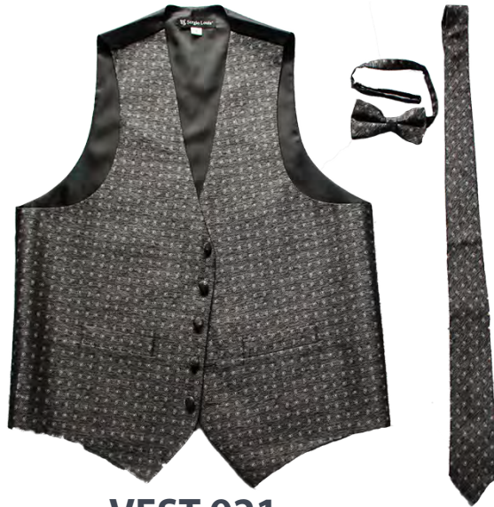
VEST 921 Charcoal