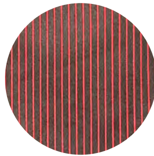
VEST-002 red stripes