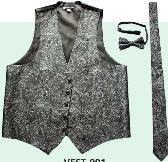
VEST-001 Big Paisley