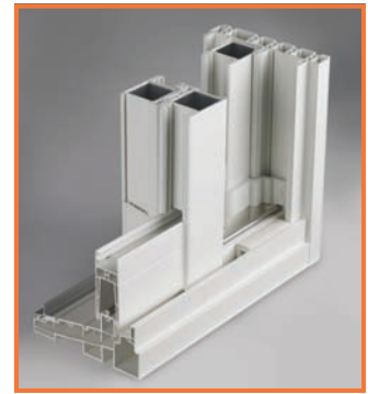
Corner Cross Section

It's our first, last and middle names. Some of the most skilled and experienced craftspeople make our products with such overwhelming pride. They make sure you receive...All vinyl multi-chamber profile design...Full perimeter double and triple weather stripping...Removable panel support...Premium sealant...Anodized aluminum tracks...Zinc plated double tandem wheels with sealed bearing...Extruded aluminum screen. Everyone at OceanView shares one and only one goal: providing customers with not only the highest quality, longest lasting, easy-to-use doors but also highest value products available anywhere.