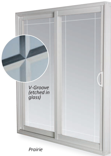
V-Groove (etched in glass)