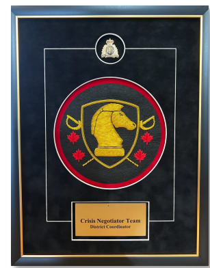
Plate Information: (Please print clearly)