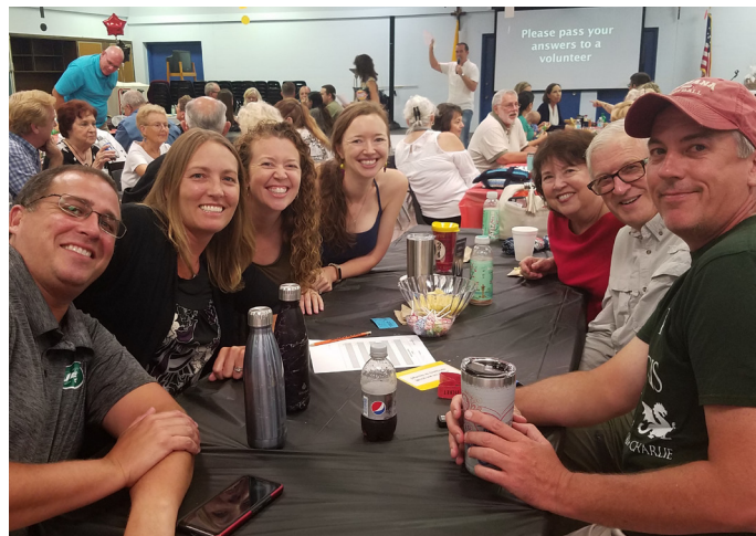
Seven Blind Mice, the big winners.