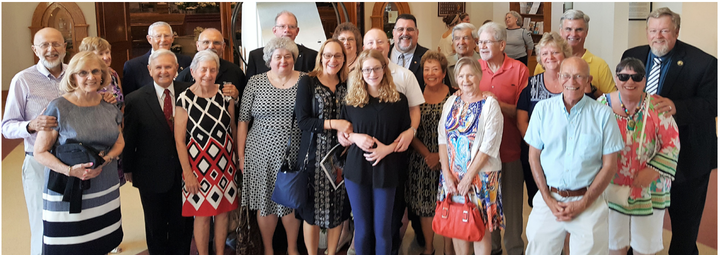
Here we are attending Mass with our spouses.