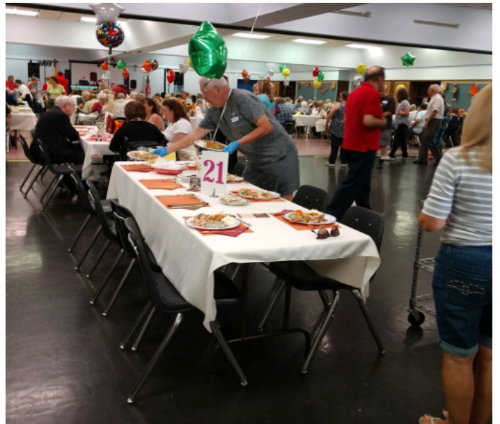
Always helping in the Parish Center with various gatherings.