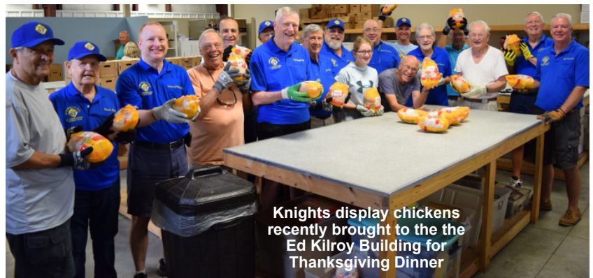
Knights display chickens recently brought to the the Ed Kilroy Building for Thanksgiving Dinner