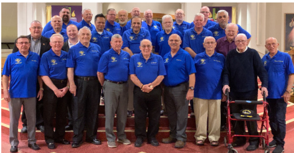
Our council met for a casual get together with our spouses on December 11 in the parish center. Afterward, we all gathered for a group photo.