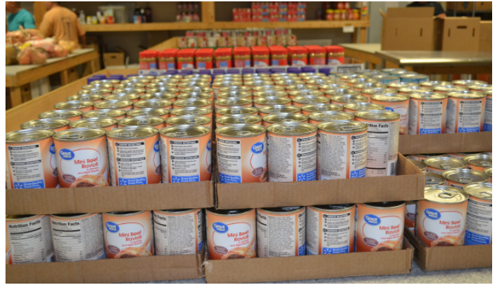
Some of our members help in the Ed Kilroy building, preparing various food items to be distributed to the needy.