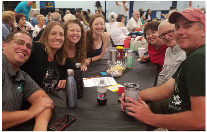
Our council helped with Trivia Night