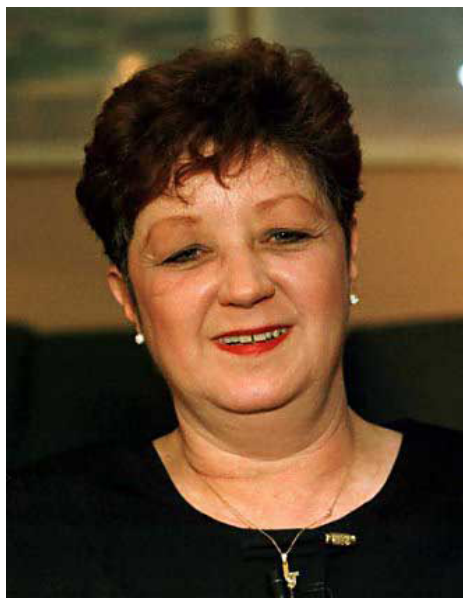
Norma McCorvey "Jane Roe"

In 1970, Norma McCorvey, under the pseudonym "Jane Roe," filed a law suit challenging the Texas laws that criminalized abortion. Eventually, the case reached the U.S. Supreme Court