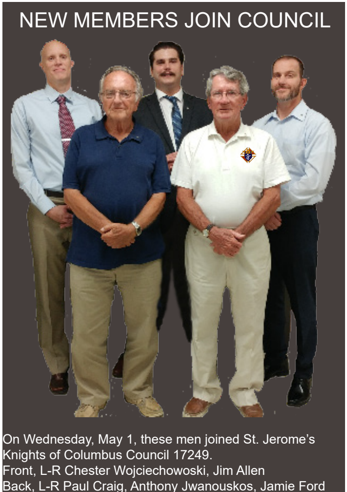
On Wednesday, May 1, these men joined St. Jerome's Knights of Columbus Council 17249.