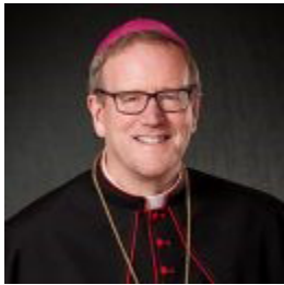
Bishop Robert Barron

In California, as in almost every other state, clergy members (along with a