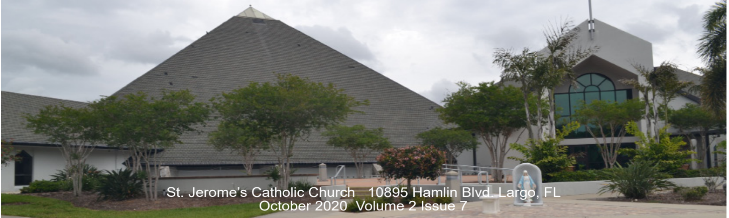
St. Jerome's Catholic Church 10895 Hamlin Blvd Largo, FL October 2020 Volume 2 Issue 7