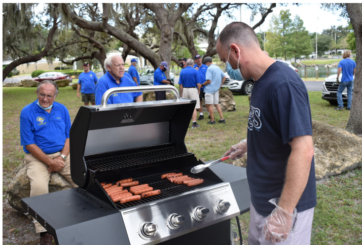
Hot dogs and chips were served as we waited for the chickens to arrive.