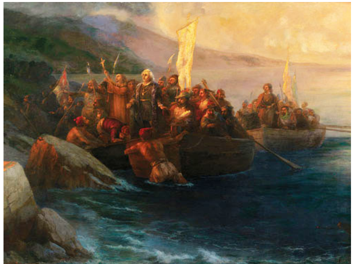
A painting depicts Christopher Columbus and shipmates landing at sunrise Oct. 12, 1492, on the island he named San Salvador

The first Columbus Day celebration took place in 1792, when New York's Columbian Order—better known as