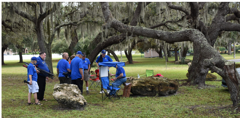
This is the area where the grotto is planned to be located.