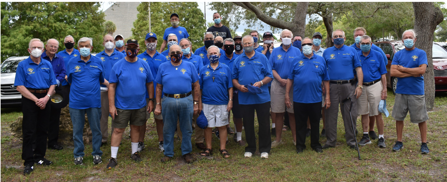
Our council members who showed up to discuss chickens and the grotto. It was a relief to be together.