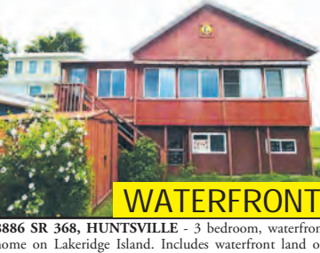
8886 SR 368, HUNTSVILLE - 3 bedroom, waterfron home on Lakeridge Island. Includes waterfront land on ooth sides of the road. Huge kitchen, several "conversation rooms." Large room with wall of windows on waterside for amazing water views. Several docks. Needs TLC and a ew well. $229,900. Call Diane "Teri" Frymyer at 937-