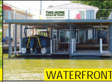
469 WEDGE ISLAND LN. RUSSELLS POINT -ND LN, NOGE— home situated on open water on remodeled in 2012. Amazing dock for relaxing and entertaining. Open Wedge Island, Totally with huge deck above for relaxing and entertaining. Open loor plan. Awesome open water views from living area and naster bedroom. Call Diane "Teri" Frymyer at 937-539-