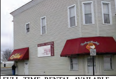
FULL TIME RENTAL AVAILABLE -1 bedroom, 1 bath, 2nd floor apartment. $481/month includes sewer, water, and electric. Call Angie Szaruga at 937-245-