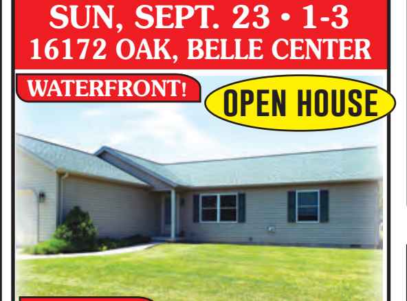
$268,000 Walk out your back door to your boat dock or just relax on your covered patio at this 3 bed. 2 bath custom Unibuilt Home located in Indian Lake Shores.