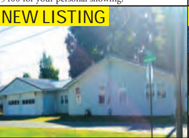
14149 ROSEWOOD AVE, LAKEVIEW Move in ready, furnished 3 bedroom, one floor plan home so close to the lake! Features central air, 2 car garage and a covered carport for all your toys. Don't delay, call today! Tina Pearson,