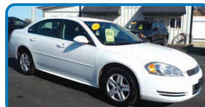
2010 CHEVROLET IMPALA LS