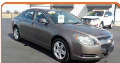
2012 CHEVROLET MALIBU LS