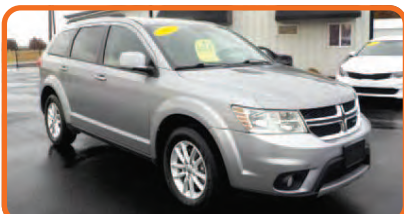
2016 DODGE JOURNEY SXT