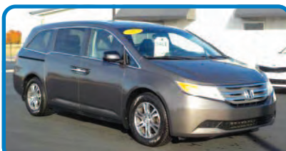
2012 HONDA ODYSSEY EX-L