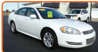
2012 CHEVROLET IMPALA LT