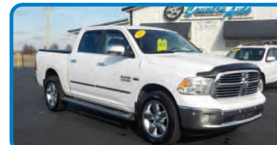
2015 RAM 1500 BIG HORN