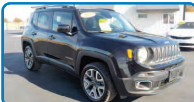
2016 JEEP RENEGADE LATITUDE