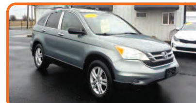
2010 HONDA CR-V EX