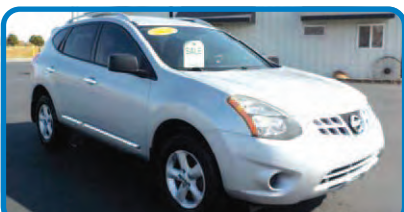
2014 NISSAN ROGUE SELECT S