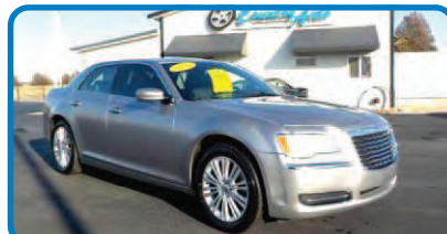
2014 CHRYSLER 300