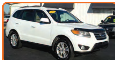
2012 HYUNDAI SANTA FE LTD.