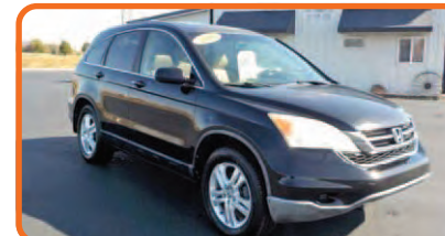
2010 HONDA CR-V EX-L