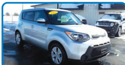
2015 KIA SOUL