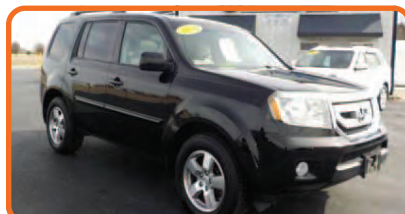
2011 HONDA PILOT EX-L