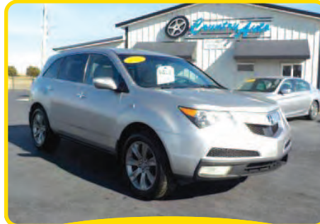
2010 ACURA MDX