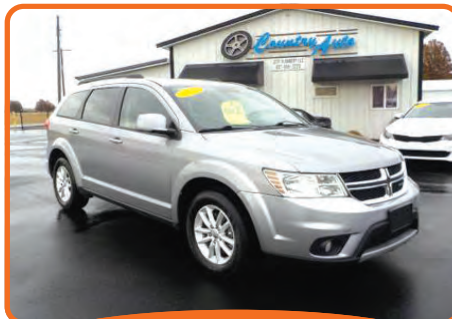
2016 DODGE JOURNEY SXT