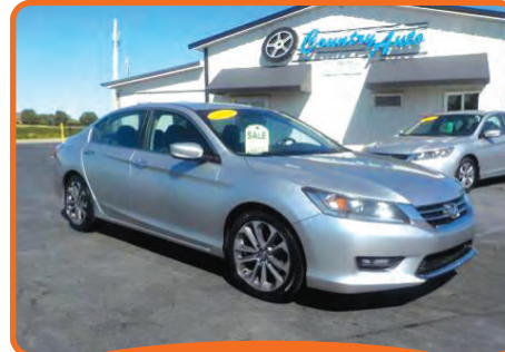
2014 HONDA ACCORD SPORT