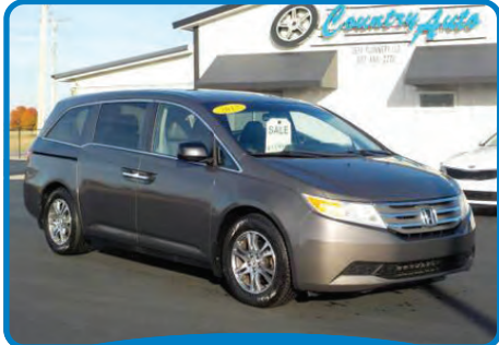
2012 HONDA ODYSSEY EX-L