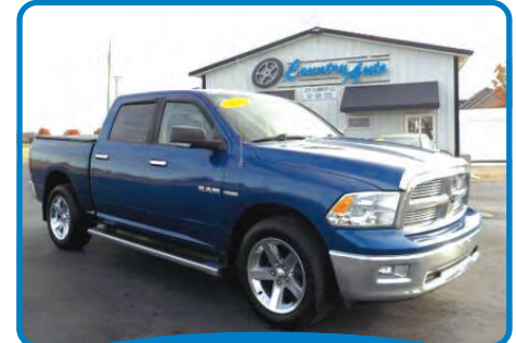
2010 DODGE RAM 1500 SLT