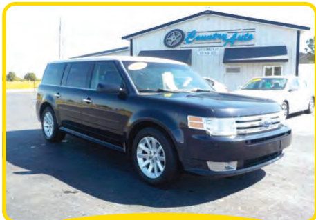
2009 FORD FLEX SEL