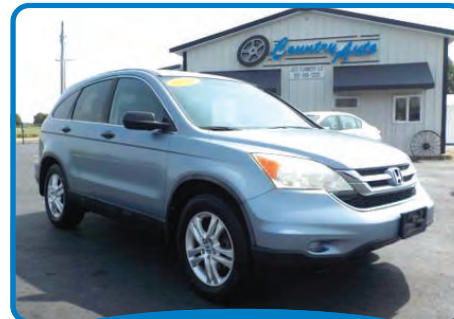
2010 HONDA CR-V EX