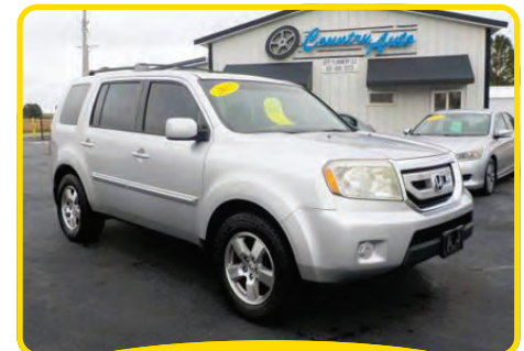
2011 HONDA PILOT EX-L