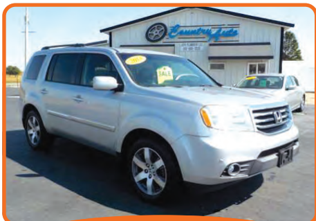
2013 HONDA PILOT TOURING