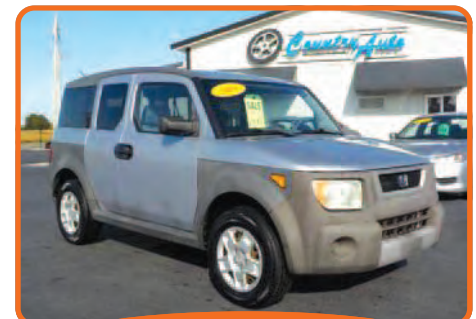
2005 HONDA ELEMENT LX

Your local BUY HERE PAY HERE connection.