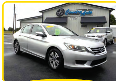
2014 HONDA ACCORD LX