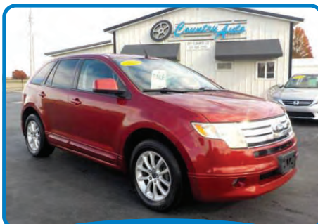
2009 FORD EDGE SEL