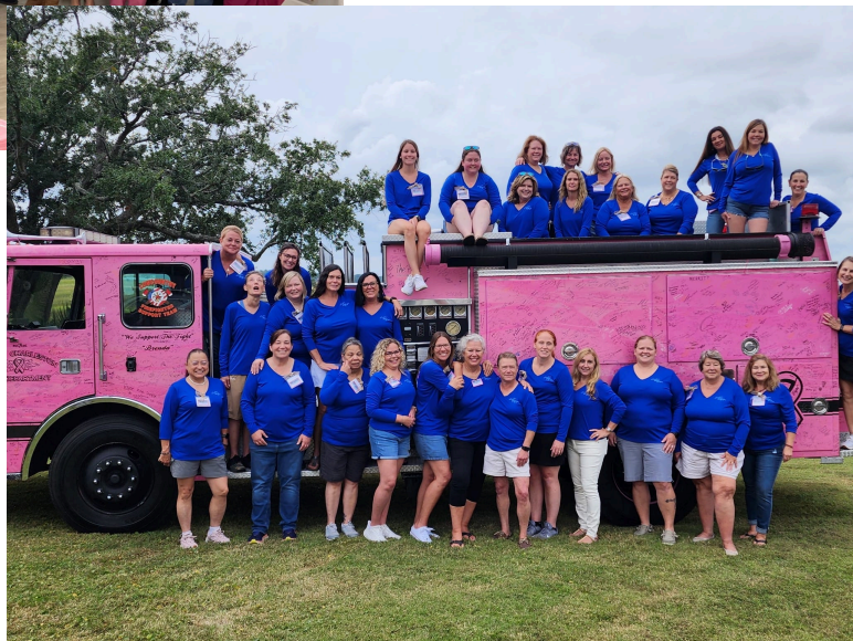
Charleston Rifle Club