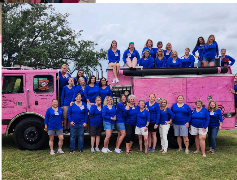
Charleston Rifle Club