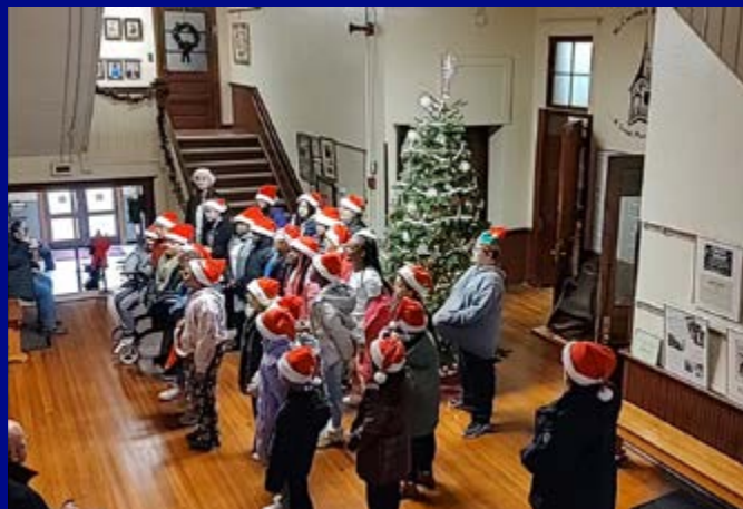
USD259 music students sang carols around the tree during the recent December 5 MSM Holiday Open House Event. After caroling, the children toured the museum and ate cookies before returning to their schools.