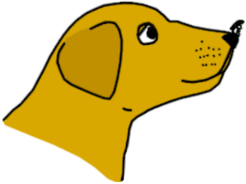
The nose is especially vulnerable to mosquito bites as there is no fur for protection there. Graphic by MarVistaVet

Let us continue to follow the young heartworm's development inside the mosquito who has taken it in with a blood meal. Within the mosquito's body, the microfilariae will develop to L2s and finally to L3s, the stage capable of infecting a new dog. How long this takes depends on the environmental conditions. In general, it takes a few weeks. A minimum environmental temperature of 57 degrees Fahrenheit is required throughout this period. The process goes faster in warmer weather but if the temperature drops below 57 degrees, the mosquitoes will die and no heartworms can be transmitted.