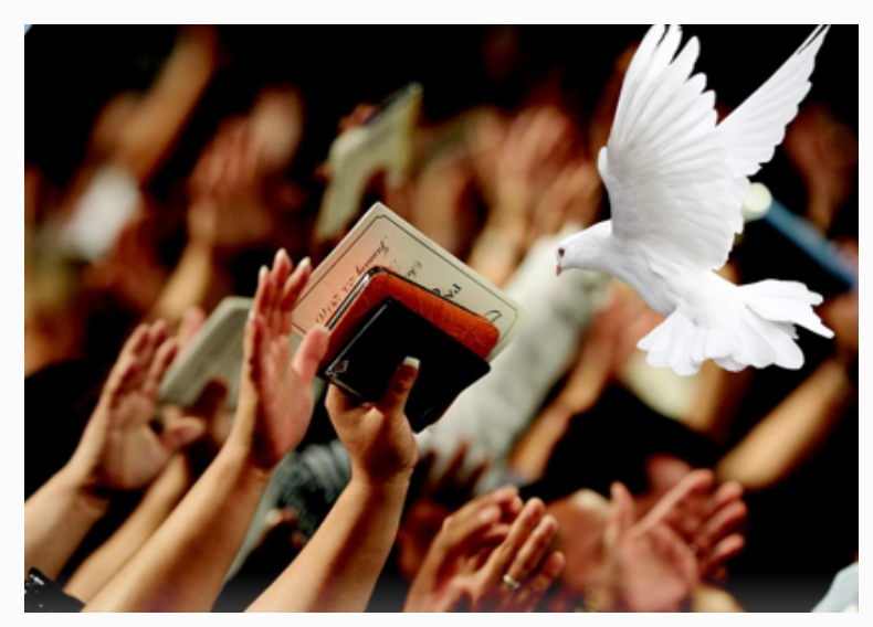
AMAZING TESTIMONIES FROM OUR MONTHLY WONDER NIGHT - EVERY FIRST FRIDAY OF THE MONTH IN CALGARY, AB