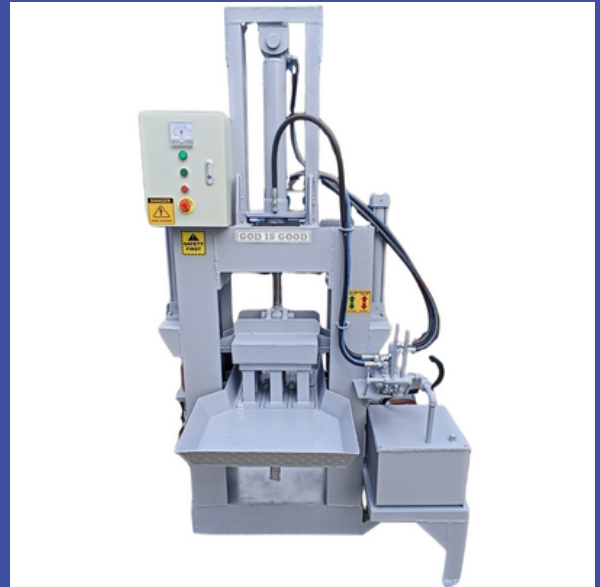
Eco Bricks Machine

Capacity: up to 300 briquettes per hour Uses: Wood chips, Rice Husks, Charcoal, Saw Dust, Coconut Husk