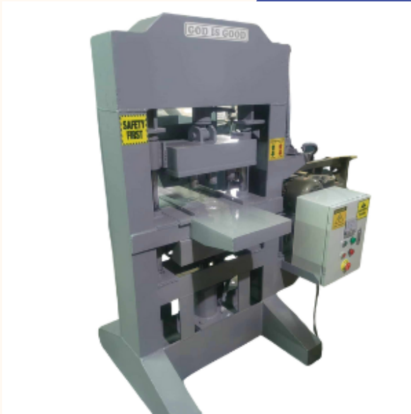
Charcoal Briquette Machine