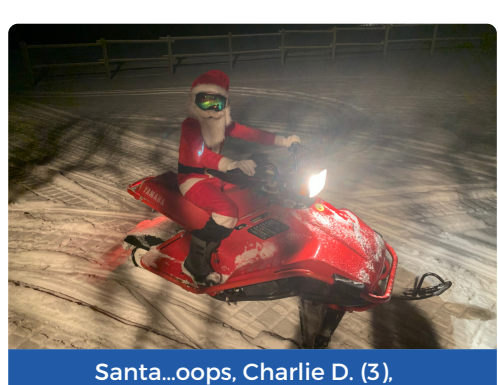
had fun snowmobiling