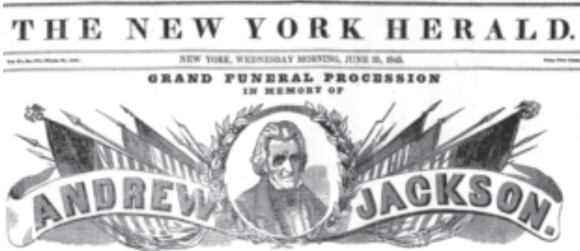
Banner from the New York Herald announcing Jackson's funeral procession. New York Herald , June 25, 1845.

Board of Aldermen held a special meeting at which a proposal was put forth to provide $2,000 to defray the ceremony's costs. The bill was ultimately amended to $2,500 and passed without dissent. Starting on the 22nd and continuing until the 24th, a number of newspapers filled their columns with a detailed "Programme of Arrangements." The procession was to commence from Battery Park at 2 p.m. with the firing of three cannons, and then on to Chatham Street, to East Broadway and on to Grand. From there the sea of mourners would march through the Bowery to Union Park, around the Park, down Broadway and past the front of City Hall, where the main orations would take place, then ultimately return to the Battery. The Committee of Arrangements also decreed that "no banner bearing political devices, or inscriptions, shall be admitted in the Procession." 48 This, of course, hardly mattered, considering that Jackson was amply identified with the Democratic Party.