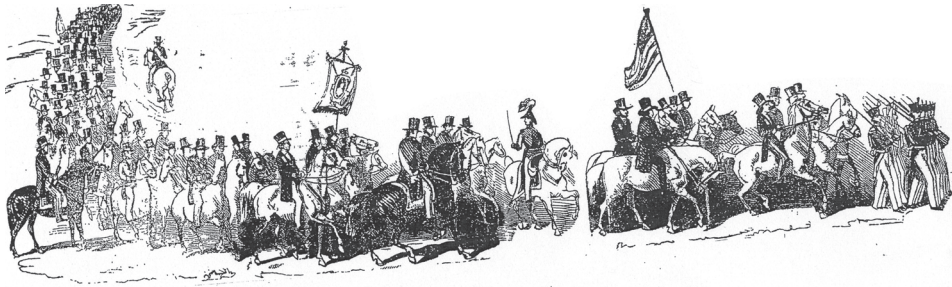
Many civic as well as military organizations took part in the procession. New York Herald , June 25, 1845.

guided the car. 52 The Albany Evening Atlas remarked: “Those who have seen the different grand displays that have been made in the Empire State for the last 50 years, say there was never one equal to the present on point of numbers, good order, respectability, and good arrangements. One spirit appeared to pervade the mass, to sink all political feeling and aid in doing justice to the memory of one who had served long and faithfully for his country’s weal.” 53