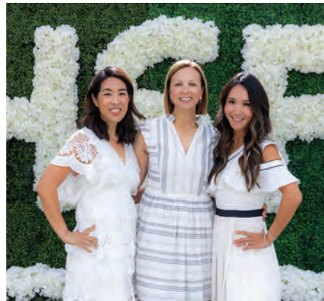
Hillsborough Classic Chairs

What a year to celebrate! We are grateful for all the parents, families and individuals who brought their community spirit and supported our schools by participating in the Hillsborough Classic, Dinner Dance and Fun Run! We sincerely thank the amazing chairs of these events for their hard work and commitment to HSF.