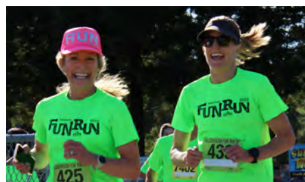
Fun Run Chairs