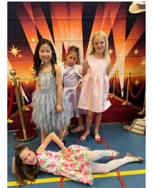
Heros Dance Pay to Play