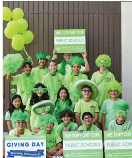
Giving Day, Crocker