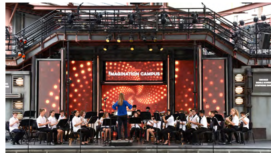
The Crocker Symphonic Band performing at Disneyland

SAVE THE DATE Hillsborough Classic Tennis October 7th Luncheon October 14th Dinner Dance and Live Auction March 4, 2023 Hillsborough Fun Run May 18, 2023