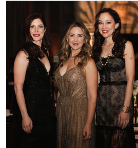
Dinner Dance Chairs