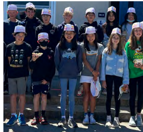
West Kids Pay to Play