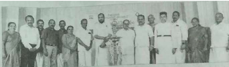
● ഐക്കൺ ചാരിറ്റിസ്സ് സ്നേഹദീപം ചാരിറ്റബിൾ ട്രസ്റ്റും സംഘടിപ്പിച്ച പഠന സഹായ വിതരണ പദ്ധതി ഉദ്ഘാടനം ചെയ്തപ്പോൾ.