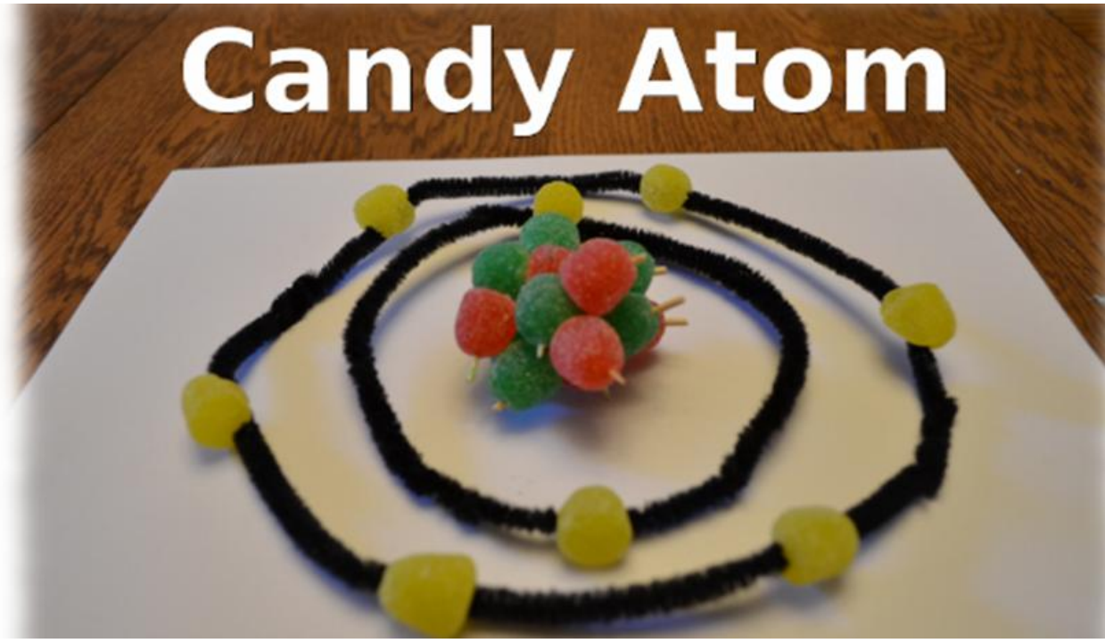
Example of candy atom model