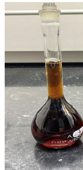
Example of sugar+water solution that has been heated.

The takeaway is carbon quantum dots have fluorescence, which means they emit light by absorbing light and the emission is short-lived.