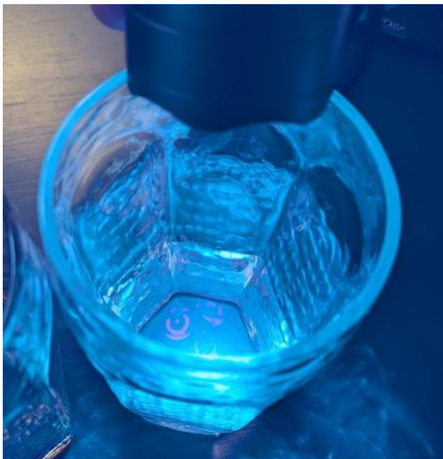
Sugar+water (no heat) UV light