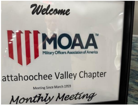
PHOTO GALLERY OF OUR APRIL MEETING