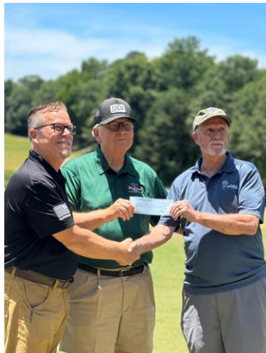
The Plummer Home