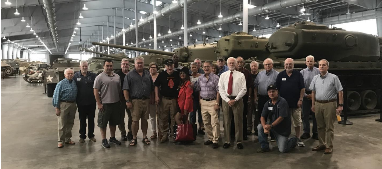
Most of those who walked among the Armor/Cavalry Story of Vehicles