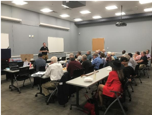
PHOTO GALLERY OF OUR SEPTEMBER MEETING

Chapter Formed March 1959 SEPTEMBER 2024 NEWSLETTER