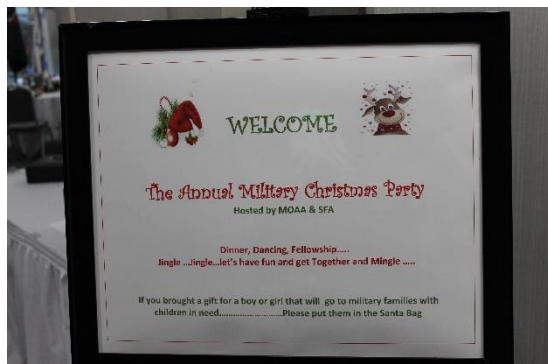
PHOTO GALLERY OF OUR CHRISTMAS PARTY