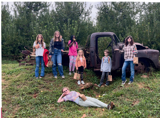
Apple Picking at Carter's Mountain