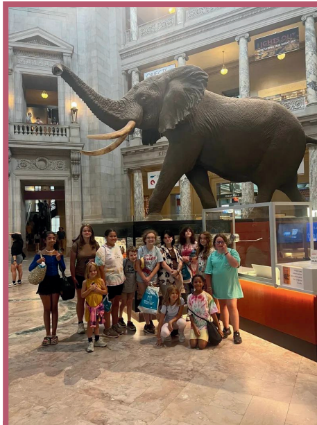
Smithsonian Washington, D.C.