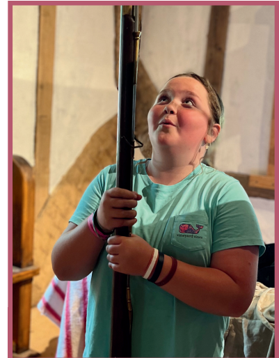
Henricus Historical Park