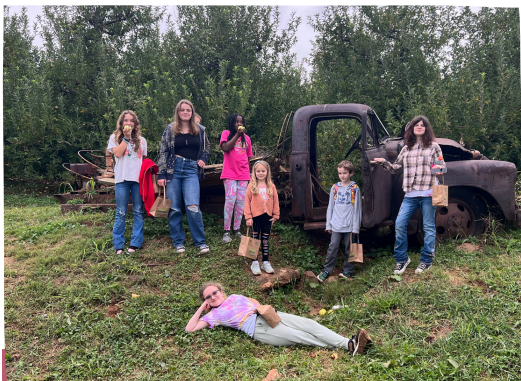
Apple Picking at Carter's Mountain