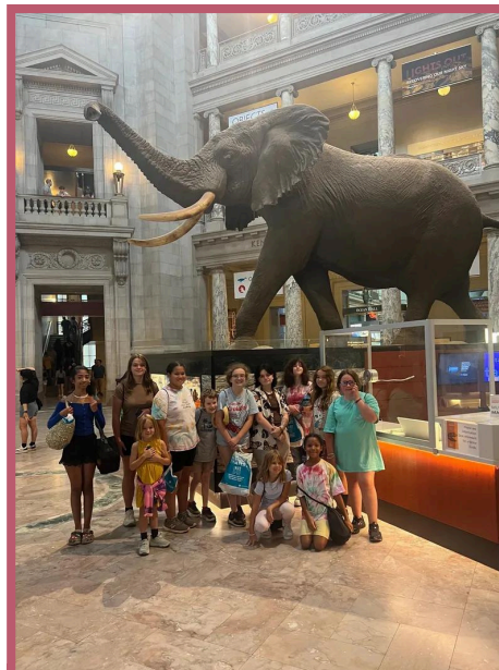
Smithsonian Washington, D.C.