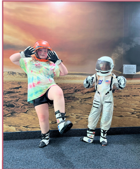
VA Air & Space Science Center