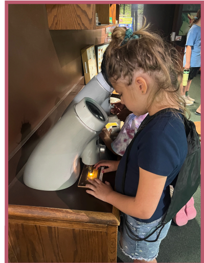
Virginia Living Museum