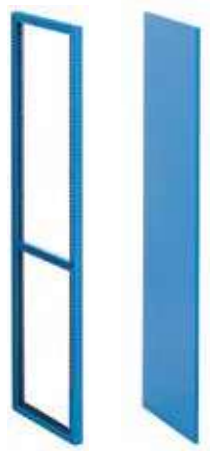
Vertical Side Frame End Panel

All Basic components are ordered separately from the charts on the following pages. Be sure to match widths and depths of the drawers, shelves, etc. to the section width and depth you are building. For step-by-step directions for ordering, see page 80–81.