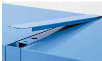
Frame Top Fill-In Strip