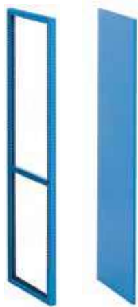
Vertical Side Frame End Panel

All Basic components are ordered separately from the charts on the following pages. Be sure to widths and depths of the drawers, shelves, etc. to the section width and depth you are building. For step-by-step directions for ordering, see page 80-81.