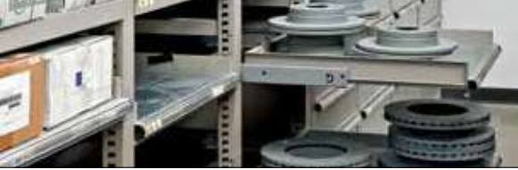
FULL DEPTH STORAGE WALL SYSTEM 27 ¾" DEEP