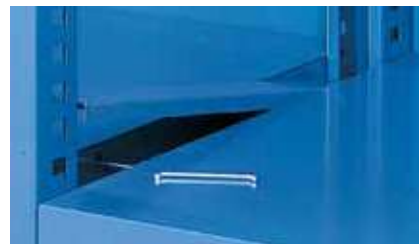
Intermediate Fill-In Strip