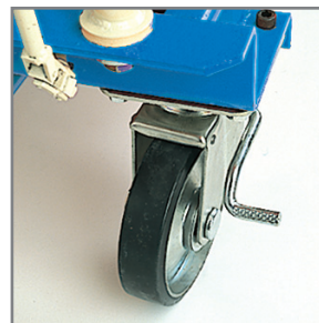
Dual-Action Caster Brake Locks Wheel and Swivel