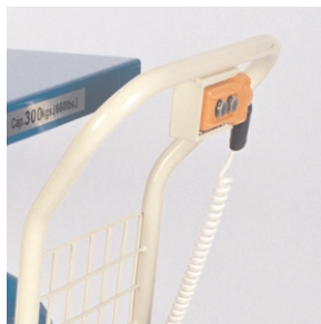
Removable Pendant Push-Button Control in Handle Mount (BXB)