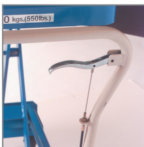
Convenient Hand-Lever Lowering Control For Model BX