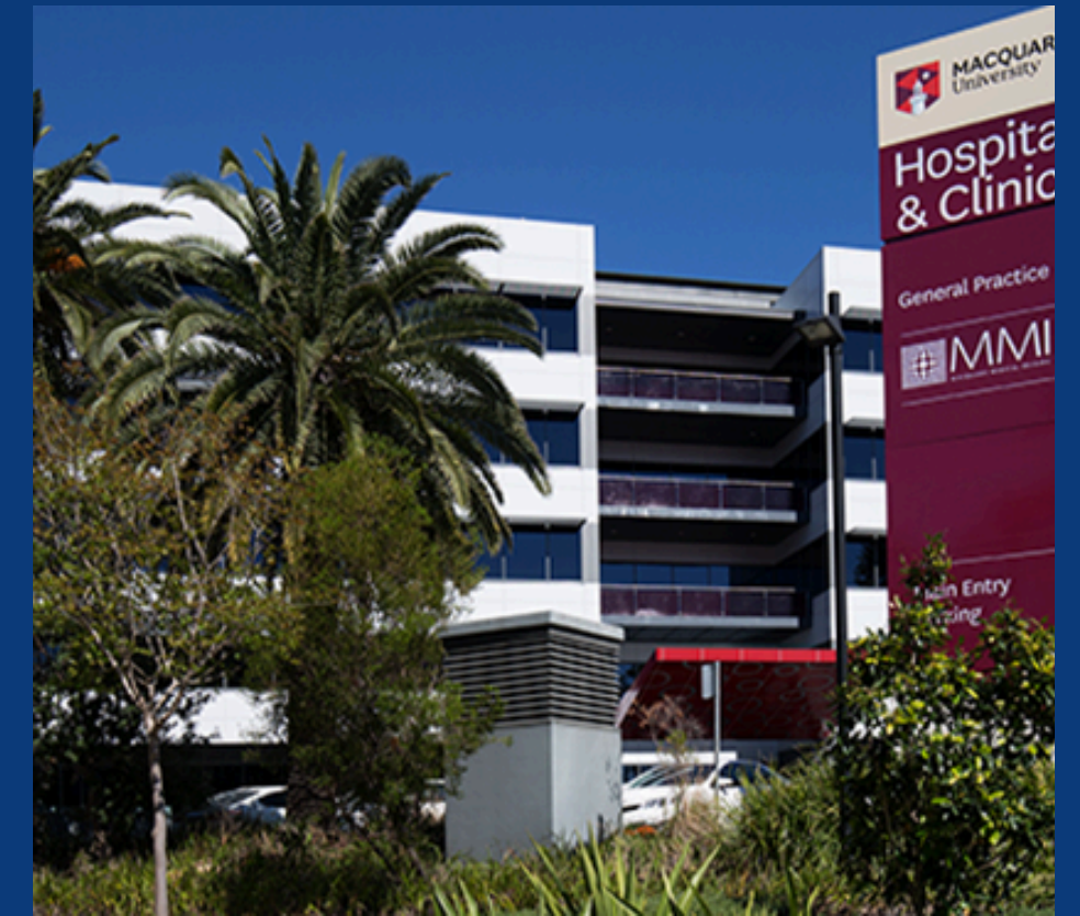
Macquarie University Hospital Car Park, Sydney