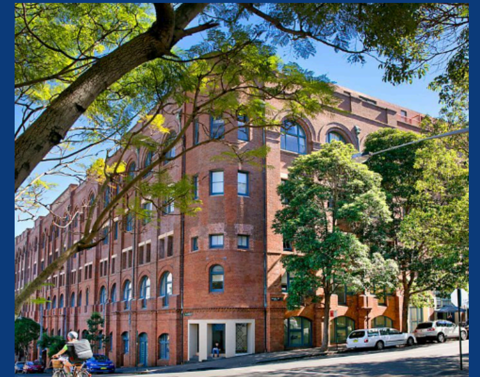
Dalgety Square Strata, Sydney

Our workmanship has assisted many significant projects come to life. Here is a small taste of some recent ones.