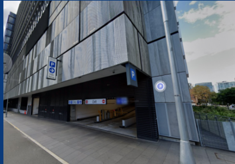
Zollner Cct Parking, Sydney