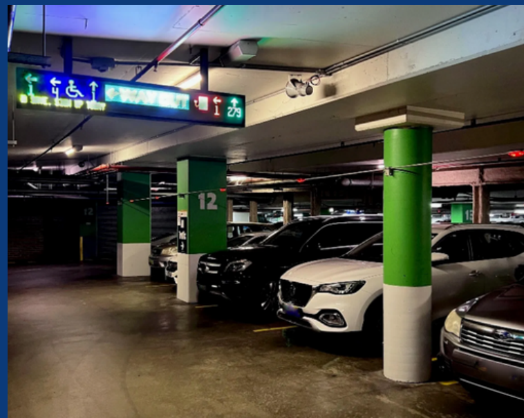
Bankstown Sports Club, Sydney