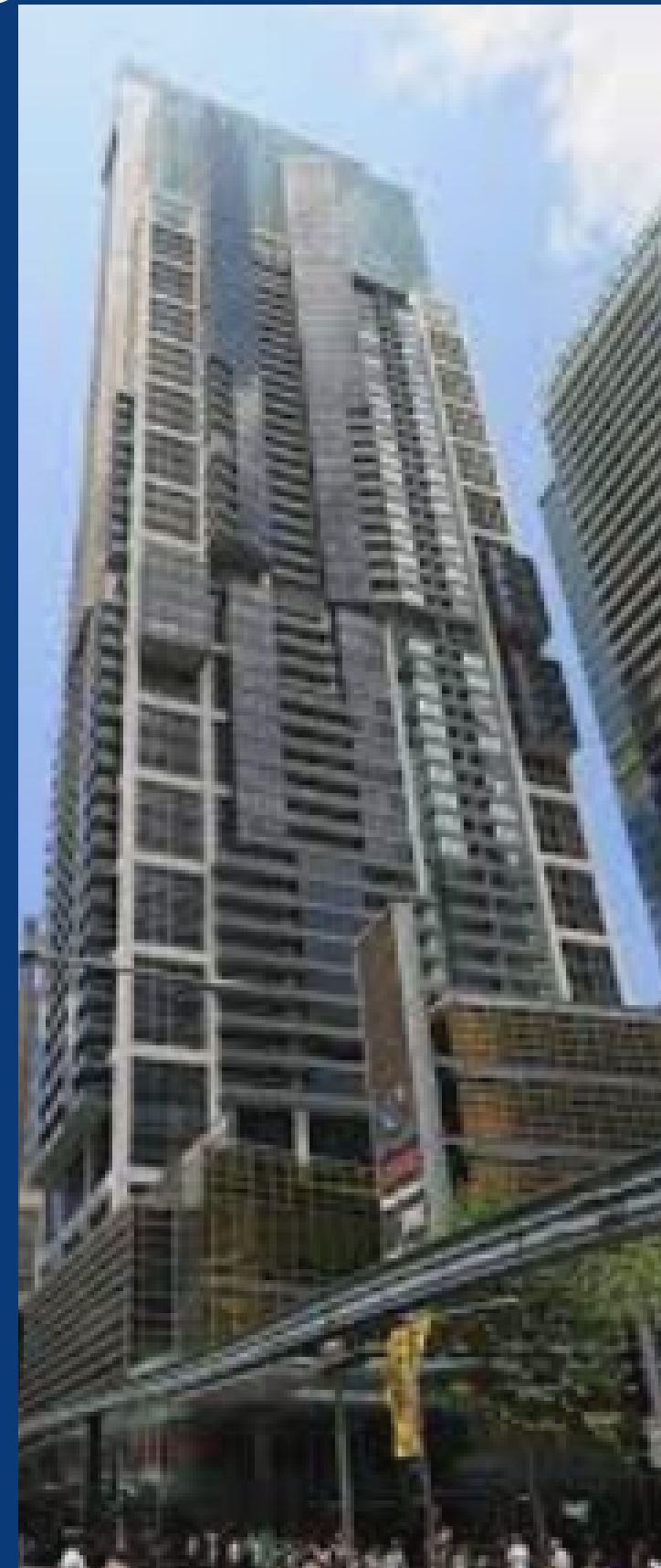
World Square, Sydney