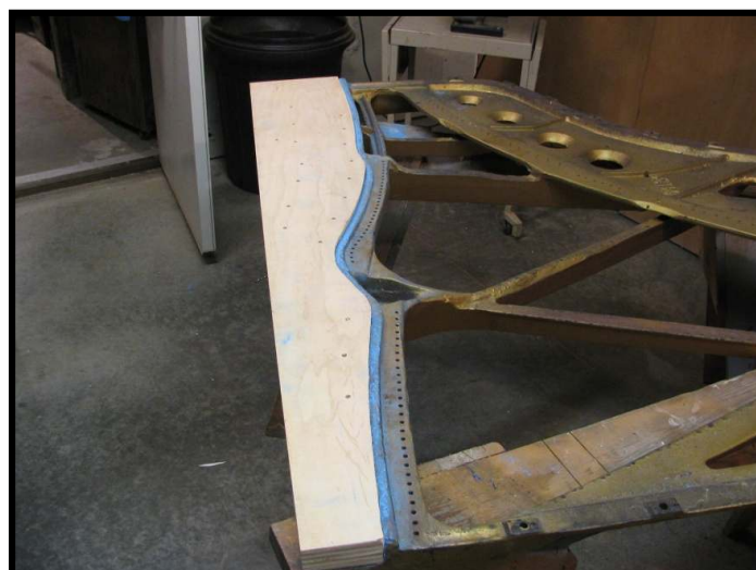
Underside of cast iron plate with new pinblock installed.

Because of the nature of the work involved with this procedure, it would be necessary for the piano to be transported to the workshop.