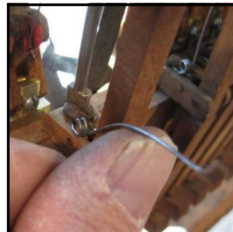
Bent into position

The first step to putting in new damper springs is to remove each damper assembly in order to clip the old springs. A flange screw is first backed out. Once the old spring is clipped the damper assembly is returned to the action and a new spring installed. The spring is designed to hook around the flange screw, after which it is bent into position. The end of the spring goes in a felted slot designed to allow the spring to slide freely up and down in as the damper is used.