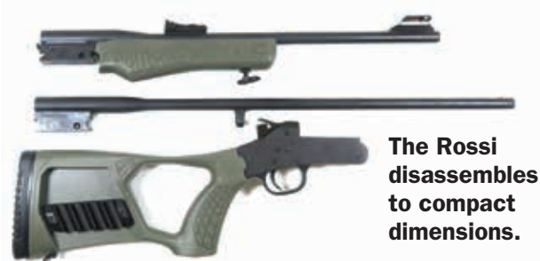
The Rossi disassembles to compact dimensions.

Buttstock ..... Textured synthetic, Olive Drab, solid rubber recoil pad, sling swivel Buttstock LOP ..... 11.5 in. Forend..... Textured synthetic, Olive Drab, sling swivel Sights Shotgun Barrel ..... Brass bead Sights Rifle Barrel ..... Adjustable rear fiber optic; hooded fiber optic front Trigger Pull Weight ..... 6.2 lbs. Safety ..... Manual hammer block, transfer bar Warranty ..... 1-Year Telephone ..... (800) 948-8029 Website ..... RossiUSA.com Made In ..... Brazil