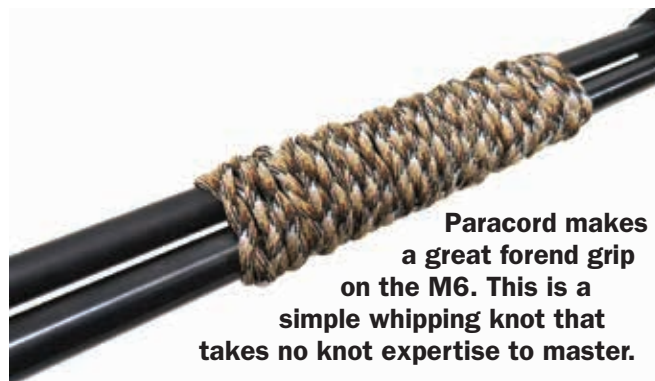
Paracord makes a great forend grip on the M6. This is a simple whipping knot that takes no knot expertise to master.

The M6 features a manual hammer with a knob