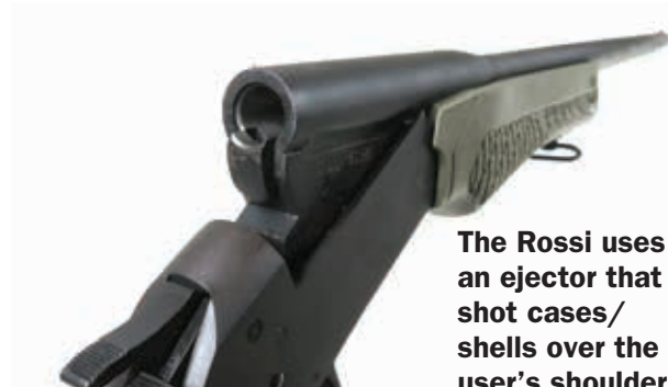
The Rossi uses an ejector that shot cases/shells over the user's shoulder.