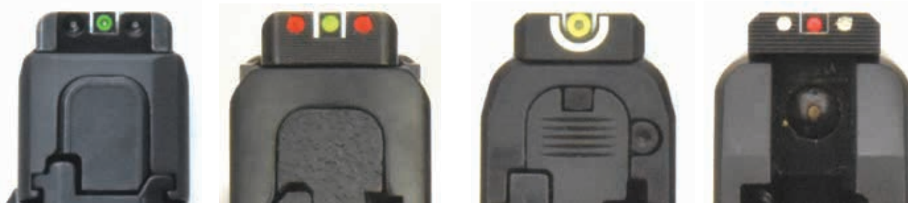
From left are the sight pictures for the SIG P365XL, S&W Shield, Springfield Hellcat, and Springfield XDE. All four pistols give great daytime visibility. The SIG P365XL and the Hellcat also have tritium lamps.

Smith & Wesson introduced the subcompact M&P