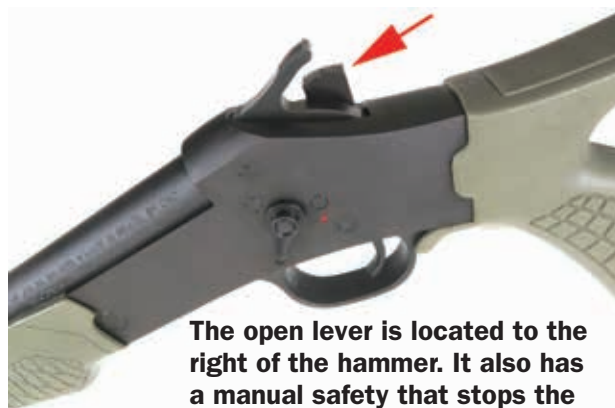
The open lever is located to the right of the hammer. It also has a manual safety that stops the hammer.