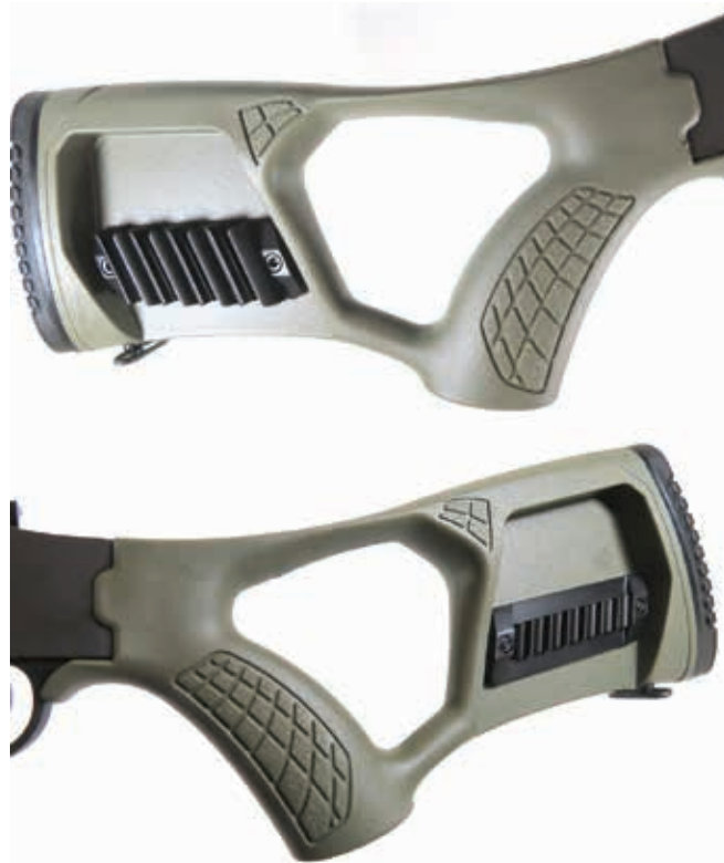
In the Rossi Match Pair stock, shotshells can be stored in the right side of the stock, top, and 22 LR cartridges in the left-hand side.

The 22 LR barrel is outfitted with fiber-optic adjustable sights. The rear sight is fully adjustable for windage and elevation. We had to zero the sight for testing. The front sight uses a hood with a hole in the top side to allow light to hit the fiber optic. We