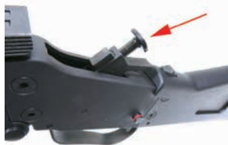
The plunger on the M6's hammer allows the user to select what barrel to shoot.

built in. Pull the knob up, and the top barrel will fire; push it down and the bottom barrel will fire. If you leave it in the middle, neither barrel will fire.