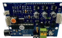
77069 Circuit Board Assembly, Select Doser 640