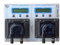
Select Doser 388