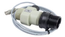
77413 #3, VTH-25, 1 1/4" Turbine Sensor Flow Range 50 - 2,500 gal / hr