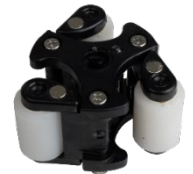
77275 Roller Assembly, Stenner, Quick Pro