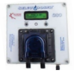
Select Doser 380