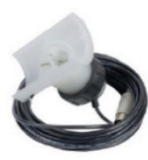
Paddle Sensor, Saddle Fitting Kit, Stenner Injection Port Flow Range 77446 - 1.5" 900 - 9,000 gal / hr 77449 - 2" 1,800 - 18,000 gal / hr 77452 - 3" 3,600 - 36,000 gal / hr