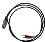
77236 Hall Effect / Tube Burst Cable Assembly, Doser Max