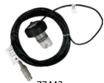
77443 Paddle Sensor with Plug Flow Range Depends on Fitting