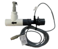
77401 #2, VTY-10, 3/4" Sensor Assembly Flow Range: 5 - 450 gal / hr