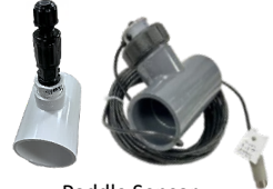
Paddle Sensor, PVC Tee Assembly Kit w/ Stenner Injection Port Flow Range 77428 - 1.5" 900 - 9,000 gal / hr 77431 - 2" 1,800 - 18,000 gal / hr 77434 - 3" 3,600 - 36,000 gal / hr