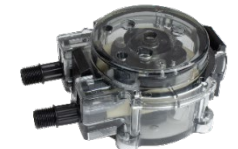
77248 Stenner Pump Head w/ Quick Pro Rollers #7 Tube