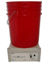
77500 Select SpinStir