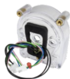
77054 Pump Head Assembly, Select Doser 640