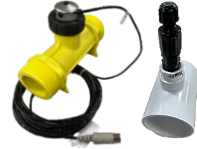
Paddle Sensor, In-Line Mold Assembly Kit w/ Stenner Injection Port Flow Range 77437 - 1.5" 360 - 3,600 gal / hr 77440 - 2" 1,200 - 12,000 gal / hr