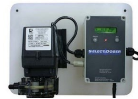
Select Doser Max