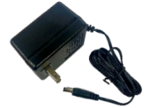
77081 12VDC Power Supply, Select Doser Max