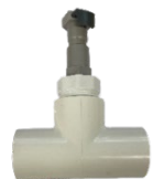
77029 Injection Port, 3/4" Select Doser 640