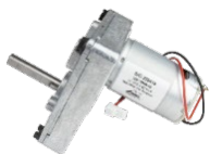
77063 Motor, Select Doser 640