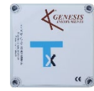
77548 Tx System