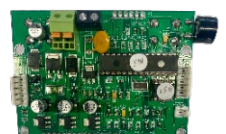
77239 Circuit Board Assembly, Select Doser Max