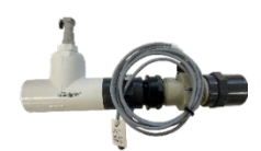
77410 #3, VTH-25, 1 1/4" Turbine Sensor Assembly Flow Range: 50 - 2,500 gal / hr