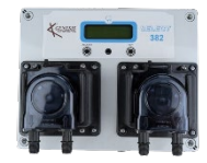
Select Doser 382