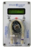
Select Doser 640

Customers must e-mail all Purchase Orders with part #s to selectdoser@genesisinstruments.com We can no longer accept POs with foreign or old part #s.