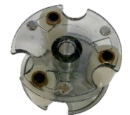
77278 Roller Assembly, Stenner, Old Style