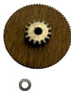
77245 Phenolic Gear, Stenner