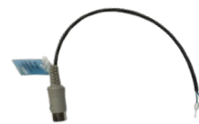
77536 Water Meter Cable