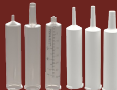
100 ML MINI-CARTRIDGE™

Luer Slip (C13), Luer Lock (C14), Paste Tip (C15), Long Nose (C12), Broad Nose (C28300SS)