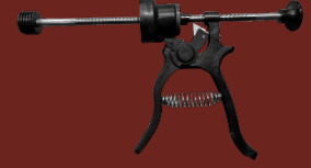
100 ML – 120 ML MINI-CARTRIDGE™ APPLICATOR