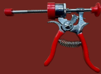
35 ML MINI-CARTRIDGE™ APPLICATOR