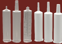
35 ML MINI-CARTRIDGE™

Long Nozzle (C300L), Short Nozzle (C300S), Broad Nose (C28300SS)