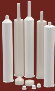
300 ML MEDI-CARTRIDGE™