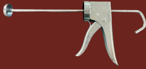
300 ML MEDI-CARTRIDGE™ APPLICATOR