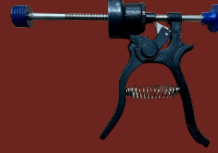
60 ML – 80 ML MINI-CARTRIDGE™ APPLICATOR