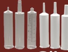
60 ML MINI-CARTRIDGE™

Luer Slip (C13), Luer Lock (C14), Paste Tip (C15), Long Nose (C12), Broad Nose (C28300SS)