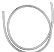
4 MM INLET DRAW-OFF TUBING, 4 FT