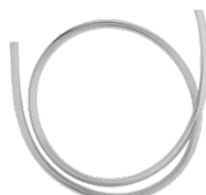
6 MM INLET DRAW-OFF TUBING, 4 FT