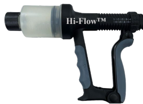
60 ML HI-FLOW™, 10 MM INLET