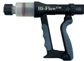
30 ML HI-FLOW™, 6 MM INLET