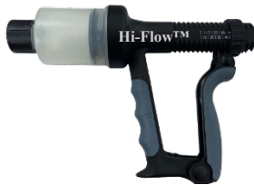
60 ML HI-FLOW™, 6 MM INLET