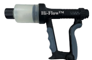
75 ML HI-FLOW™, 10 MM INLET