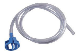
6 MM INLET DRAW-OFF TUBING WITH 30 MM VENTED SPIKE, 4 FT

Genesis Instruments – USA 1.715.953.2417 Sales@Genesisinstruments.com