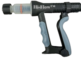
12 ML HI-FLOW™, 4 MM INLET