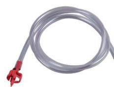
6 MM INLET DRAW-OFF TUBING WITH 20 MM VENTED SPIKE, 4 FT