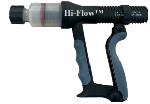
30 ML HI-FLOW™, 10 MM INLET