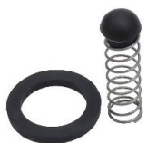
NOZZLE REPAIR KIT