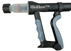
12 ML HI-FLOW™, 6 MM INLET