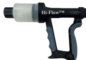
75 ML HI-FLOW™, 6 MM INLET