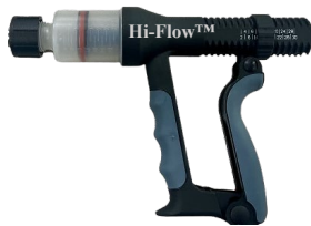
30 ML HI-FLOW™, 4 MM INLET