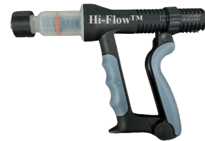
12 ML HI-FLOW™, 10 MM INLET