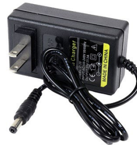
18 VOLT BATTERY CHARGER for LECTRAVET™