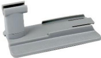
LECTRAVET™ LINE FEED MOUNT