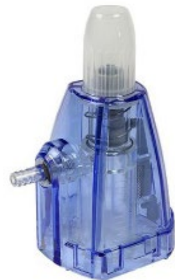
LECTRAVET™ INJECTION HEAD, 1.0 CC – 5.0 CC