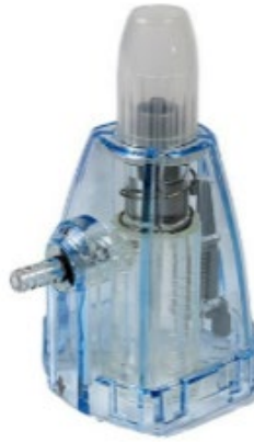
LECTRAVET™ INJECTION HEAD, .25 CC – 2.5 CC