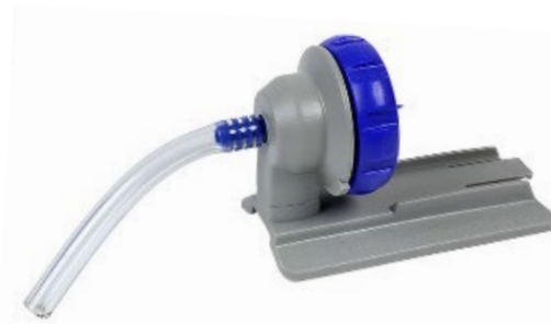
LECTRAVET™ BOTTLE FEED MOUNT