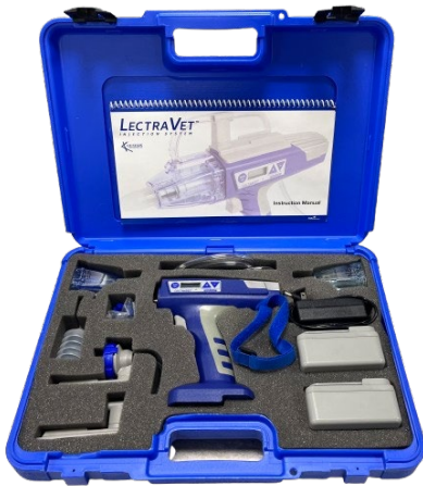
LECTRAVET™ INJECTION SYSTEM