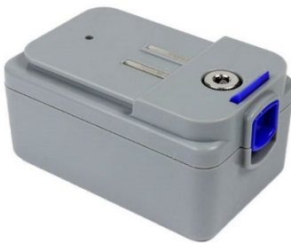
LECTRAVET™ BATTERY PACK