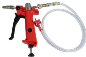
0.1 ML – 1 ML PALM GRIP™, DRAW-OFF TUBE