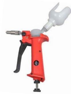
1 ML – 5 ML PALM GRIP™, 60 CC BOTTLE HOLDER