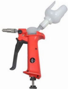
1 ML – 5 ML PALM GRIP™, 120 CC BOTTLE HOLDER