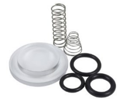
SPARE PARTS KIT 1 ML – 5 ML PALM GRIP™