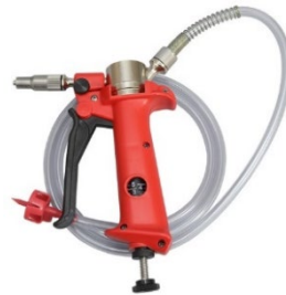
1 ML – 5 ML PALM GRIP™, DRAW-OFF TUBE