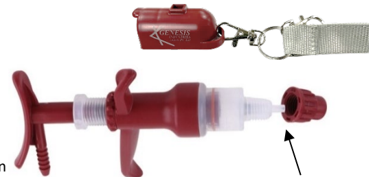
Luer Slip Tip with Hub Protector